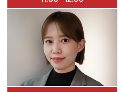
Live Event: Mix and Match