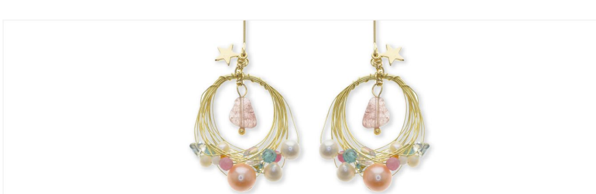
Dendy Fashion Accessories Ltd