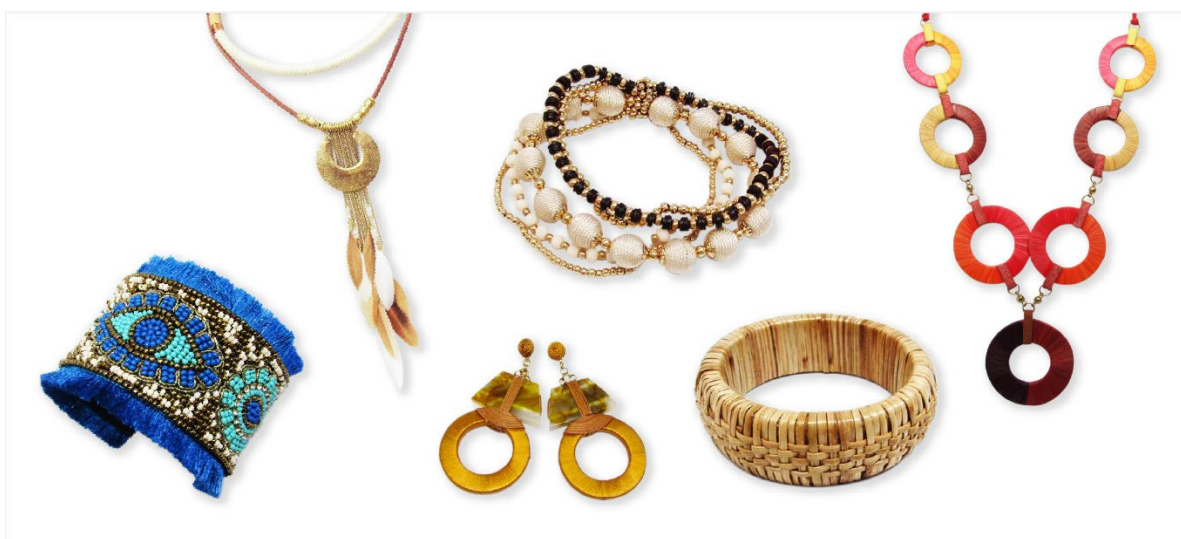
Grace Fashion Accessories